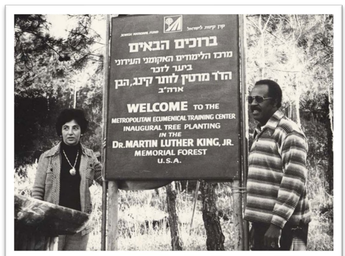
JNF Martin Luther King, Jr. Memorial Forest in Galilee