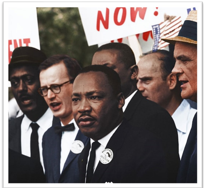
1963 Civil Rights March in Washington, D.C.

This month, as we celebrate Dr. King's life and work, we can help our children explore these connections in age-appropriate and meaningful ways.