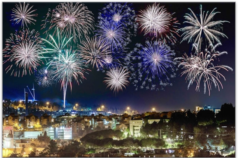
Fireworks over Jerusalem

Ask family or friends if they have been to Israel. Can they share a photo, artifact (like a kippah or small stone), or video from their trip? Invite your child to hold, touch, and ask questions.